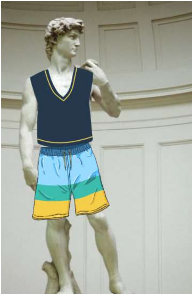
Michelangelo's David, dressed for Florida School Censors would like to see him