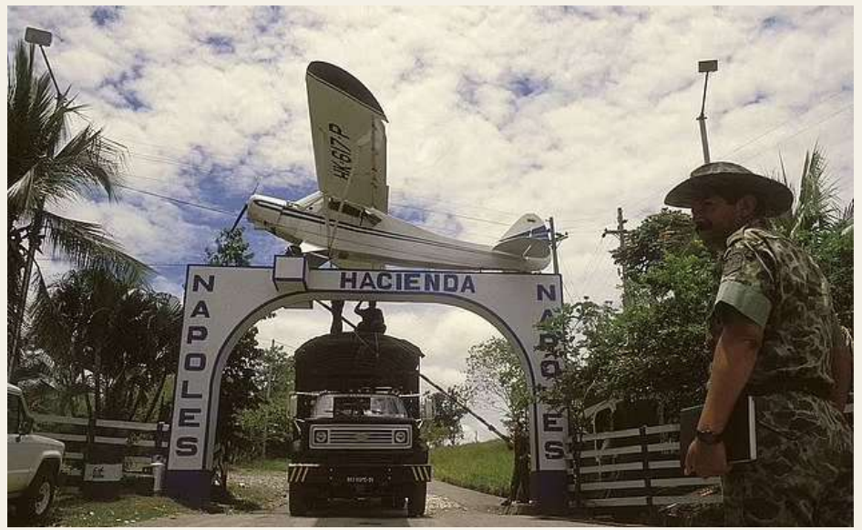
The entrance of Hacienda Napoles, the estate built by Pablo Escobar which once featured his own personal zoo

The population of hippopotami descending from Pablo Escobar's so-called "cocaine hippos" is reportedly on the rise — and some locals are growing increasingly concerned about their presence.