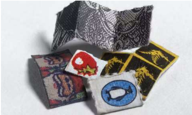
LSD is generally safe, but very high doses can cause unpleasant side-effects.

A recent article in the Emergency Medical Journal analysed posts on Reddit about trip killers. The researchers found 128 threads with 709 posts from 2015 to 2023.