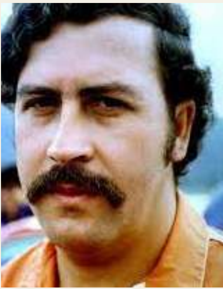
Escobar rose from humble beginnings to become the world's most powerful and feared criminal.