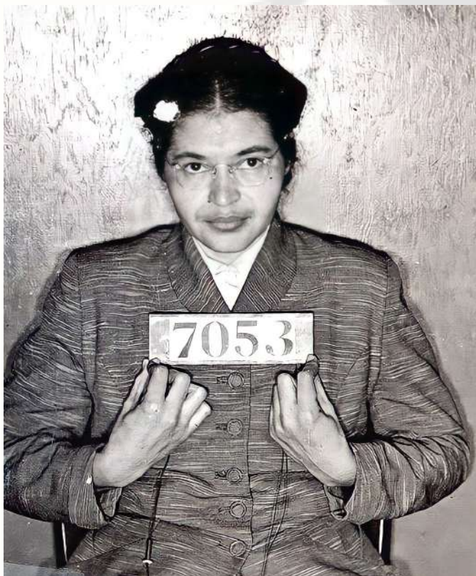
Rosa Parks' mug shot

If you're wondering what horrors must have been in these books, then prepare to be underwhelmed, confused, but not really surprised, and angry all at once. The books mostly covered LGBTQ+ individuals, transgender, and / or what some people call "woke" character themes but include books that cover historical events that right-wing types find inconvenient or uncomfortable.